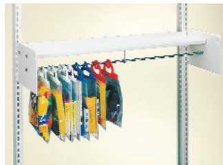
Media Bag Rack Designed to hang large or small media bags from a 36" (914 mm) rod.