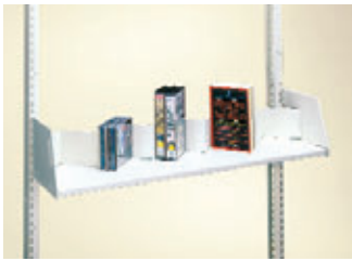
Zig-Zag Display Backstop For merchandising a variety of audio-visual and paperback media.