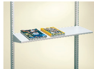
Flat Storage Shelf Includes end brackets – can be used for storage under a fixed display shelf.