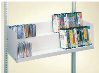
Two-Tier Sloped VHS & CD Shelf Each 36" (914 mm) shelf holds approximately 56 VHS tapes (28 per tier) or 168 CDs (84 per tier).