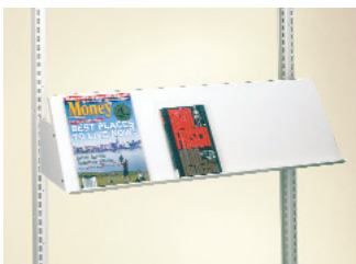
Fixed Display Shelf 11" (279 mm) high – sloped display for merchandising of books, tapes and periodicals.