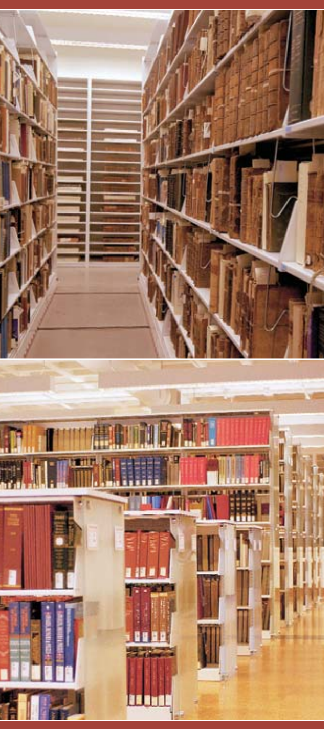
Extra-tall Spacesaver mobile and stationary shelving optimize space in the Special Collections area. Reference shelving features custom glass end-panels.

The Addlestone Library currently shelves over 500,000 volumes, with about a third of the collection on compact shelving and potential capacity for a million volumes. Bound Journals in the public space on the second floor are housed in three banks of Spacesaver powered systems , which move at the touch of a button and feature AisleGuard<sup>®</sup> as the passive safety system and PowerLink<sup>™</sup> as the monitoring system, assuring optimal operation. Across the floor, some portion of the general book collection is housed in compact shelving and the balance is on stationary shelving.