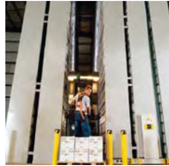
An XTend Mobile High-Bay Storage System lets you use off-site storage space more efficiently.

The result: Unprecedented levels of off-site storage density, space efficiency and cost effectiveness. The ability to store large volumes of materials or records off site and still maintain appropriate access to them. And the freedom to utilize valuable on-site space for more useful or profitable purposes.