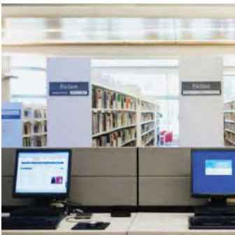
Archiving little-used materials off site gives you more usable on-site space.