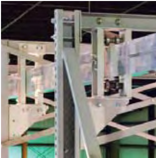
During seismic tremors, an overhead anti-tip system keeps the XTend system standing and stored materials secure.