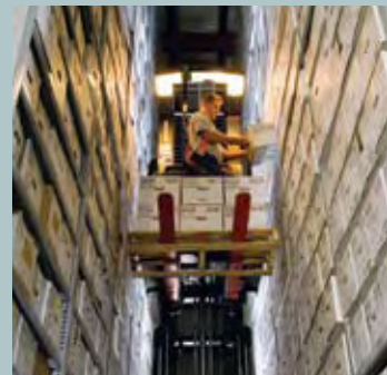
From totes to file boxes to records boxes, an XTend system accommodates a variety of storage containers easily and efficiently.