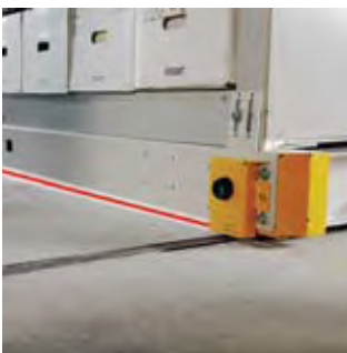
Photo Sweeps are standard safety equipment on all XTend Mobile High-Bay Storage Systems.

High on space efficiency, simplicity and safety, an XTend Mobile High-Bay Storage System from Spacesaver may well be your best choice for off-site storage compared to other available options.