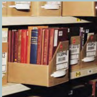
With an XTend system, you're assured that your rare or valuable materials are safely archived and thoroughly protected.