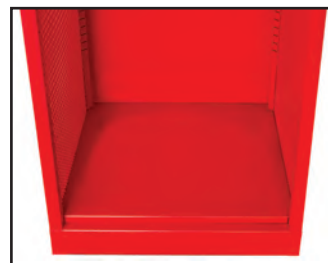
Solid base shelf also an option