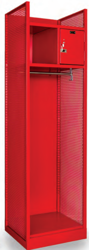
With Upper Security Box With Base