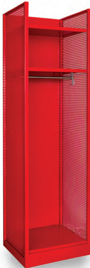
Base Model With Base