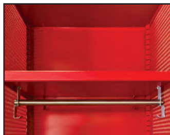
Fixed hat shelf with stainless steel coat rod with 2 single prong hooks & 2 single prong hooks at back