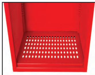
Baseless models have ventilated bottom shelf and can sit on floor or hang from wall