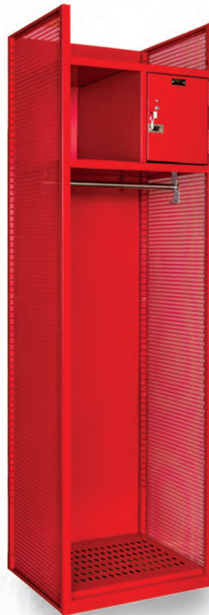
With Upper Security Box Without Base