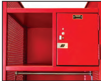
Optional Security Box uses two heavy-duty 13 gauge 7-knuckle 3-1/2" hinges and a finger pull padlock hasp