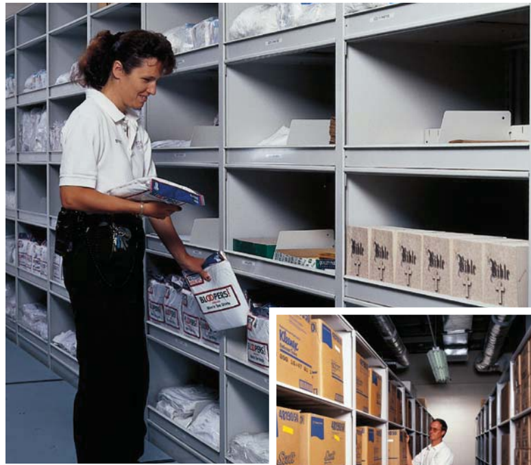
In general supply, the mobile system is designed to hold everything from small items to bulky boxes.

Sports equipment, game boards, books, paper products, toiletries and cleaning supplies are some of the items efficiently stored on a mechanical assist mobile system. The Spacesaver system makes fulfilling inmate requests easy because everything is labeled and well-organized. The shelving adjustability helps general supply personnel to fit all sizes of items on the shelves from small toiletries to very large bulk paper supplies. Shelf heights adjust as well as the shelf dividers to compartmentalize the storage and maximize the efficiency of the square footage.